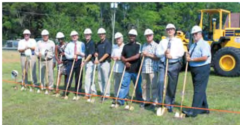
Thirty years of saving and planning for a new church sanctuary led Bellevue, Fla., Church members to the joyous June 12, 2011, groundbreaking.