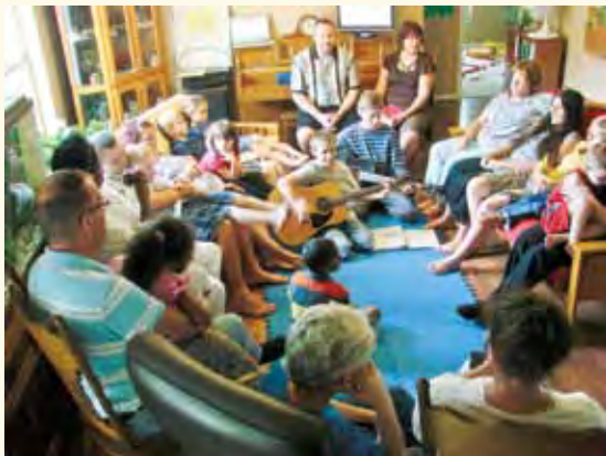
Unchurched, secular, and front-line missionaries meet in homes on Sabbath.

Simple Church is a term used to refer to small congregations that primarily meet in homes. These Sabbath home gatherings start with a team of four missionary-minded Adventists (commonly called a CORE 4 missionary team) who focus on reaching 90 percent of America's